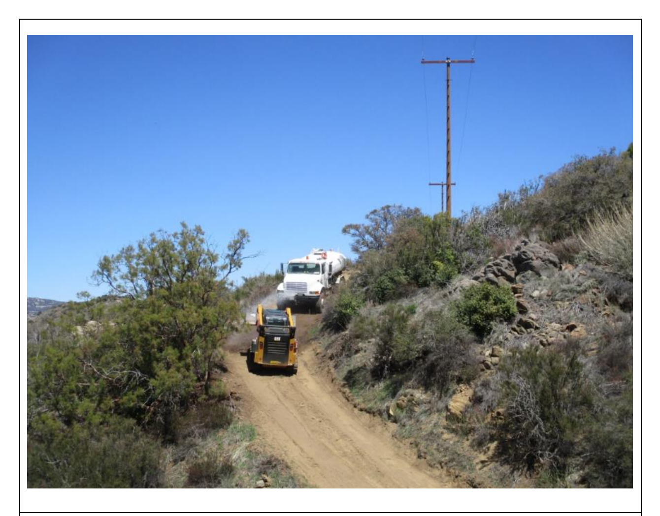
Photo 2: In accordance with APM AIR-02, a water tender was observed applying water during water bar construction at P176955 (C442).