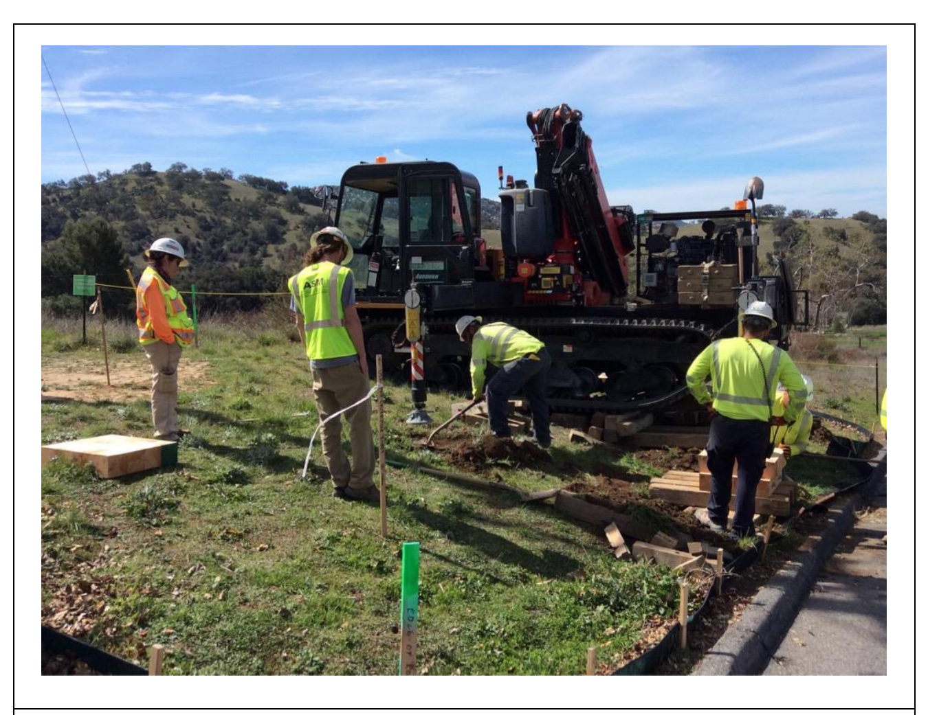
Photo 4: During site setup at along TL 682, ESA signage was present and cultural resource monitors were observed monitoring ground disturbance to level the ground for outriggers, in accordance with the Historic Properties Management Plan, MM CUL-1, MM CUL-3, and APM CUL-04.