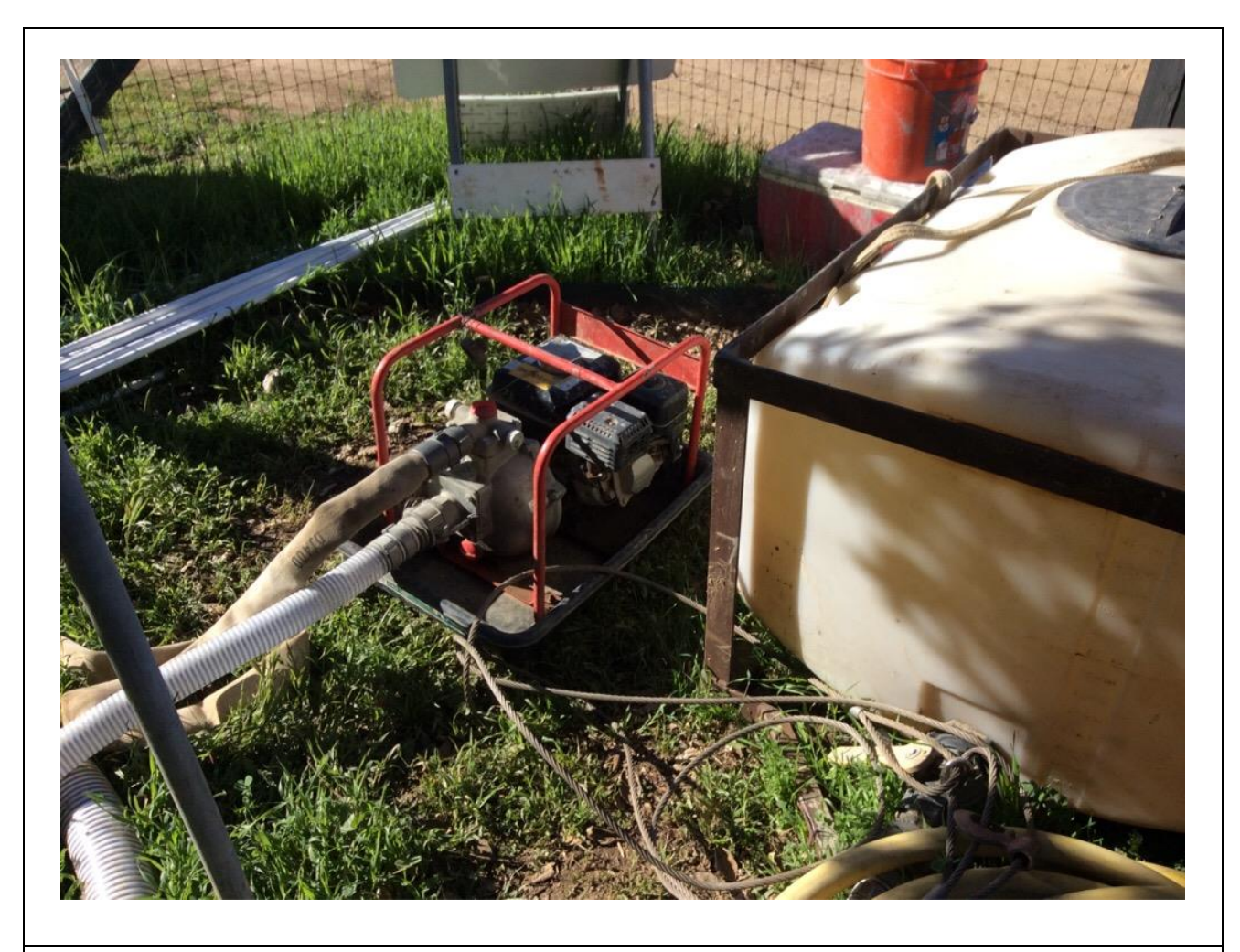
Photo 5: In accordance with MM PHS-2, a water pump at Pole Z118042 (TL 682) was staged in a drip pan to prevent any possible leaks from being discharged into the ground.