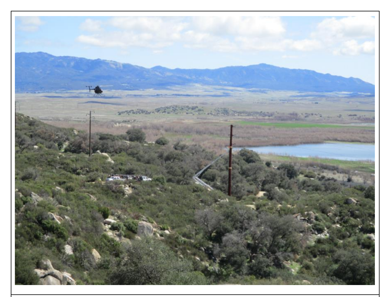
Photo 1 : Preparation for wire stringing observed at Z118161 (TL 682).