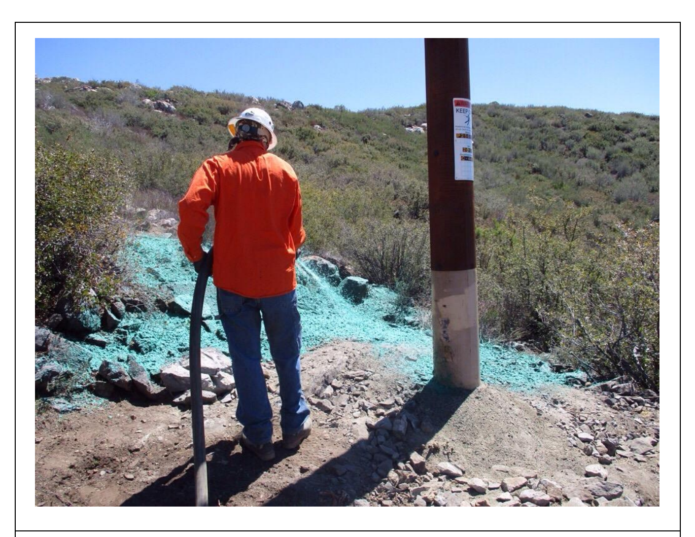
Photo 6: A construction worker was observed applying hydro-mulch at P258115 (C 442), in accordance with the Habitat Restoration Plan (MM BIO-4) and the Erosion Control Plan (MM HYD-1.